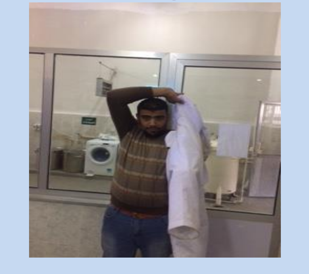
5- After putting on or changing a clothing and after dealing with ill person or a baby's nappy.