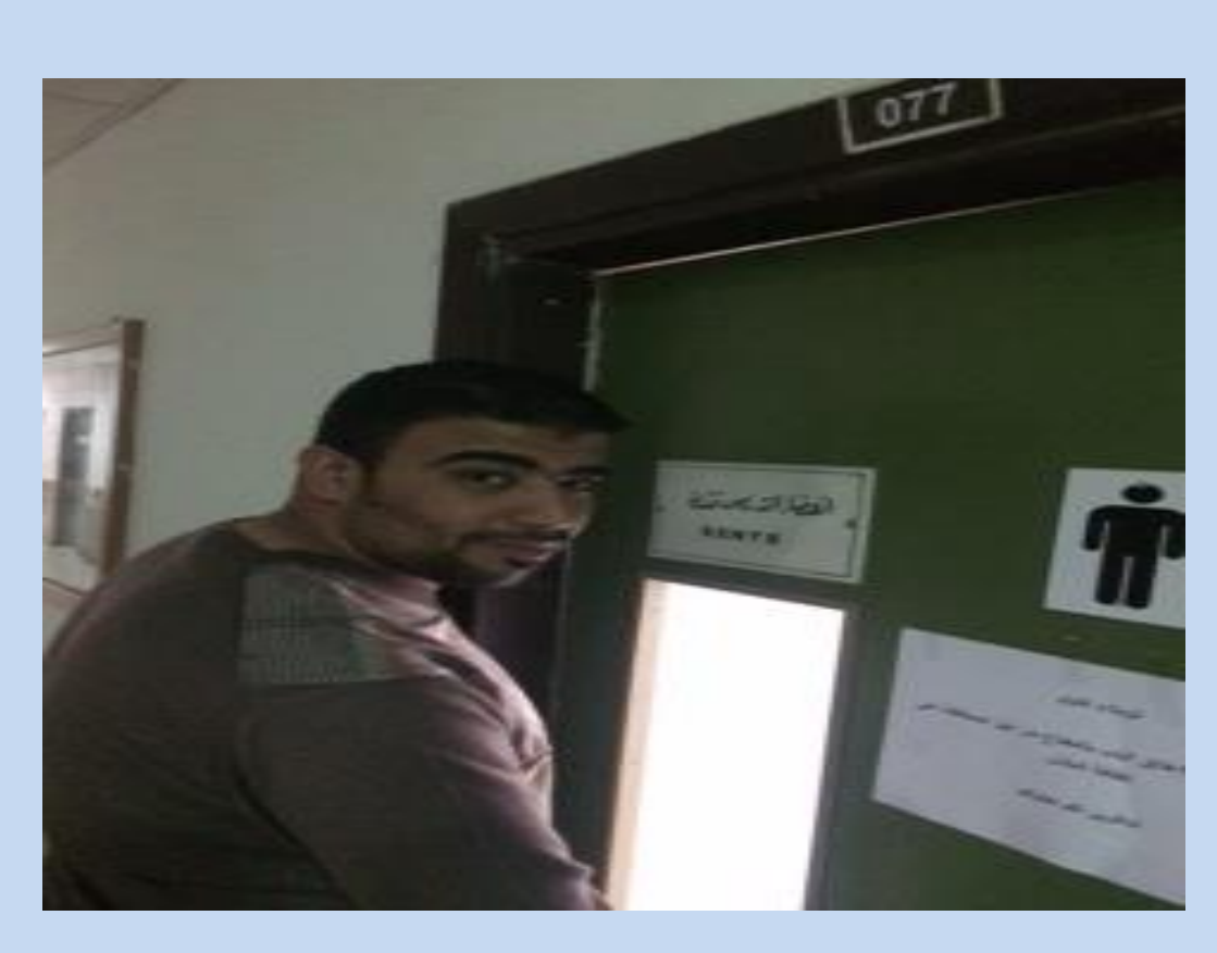
1- After using toilet

The correct hand washing procedure is essential to prevent contaminating food and reduces the risk of germ spreading. Always use warm water (35-45°C), liquid soap and disposable paper towels. Food handler must wash hands regularly through the working day. Always wash your hands in the following cases: