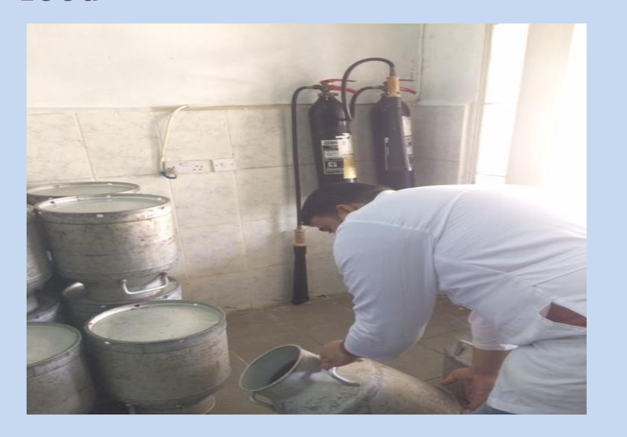
3- When entering food storage areas