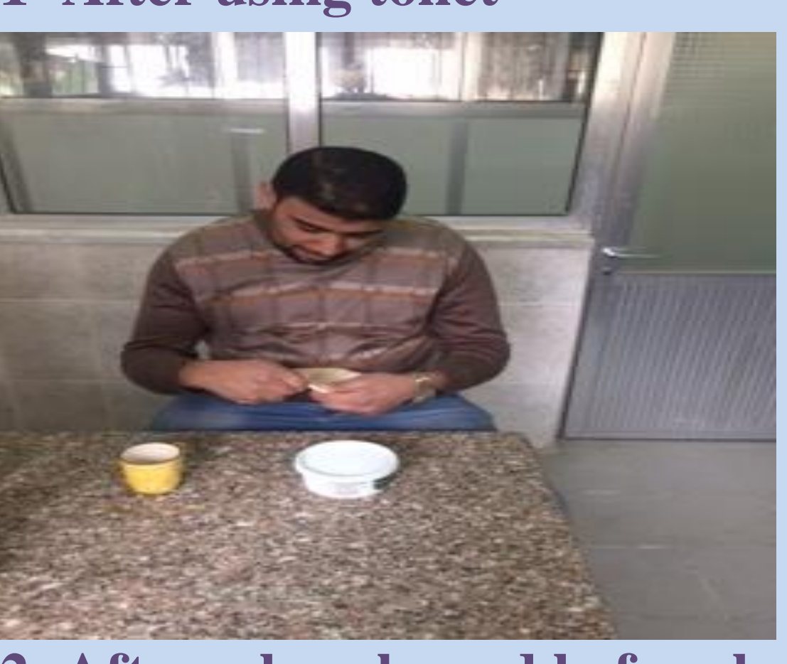
2- After a break, and before handling ready to eat food