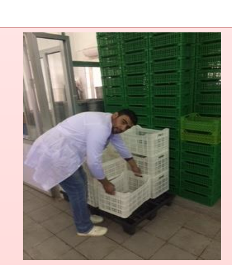
7- After handling pets, boxes or any waste