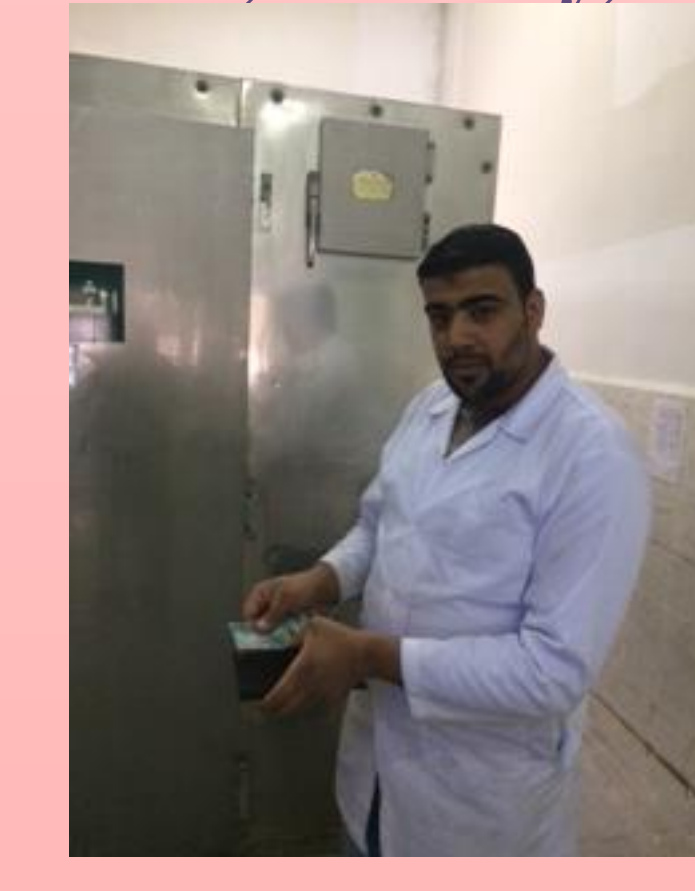
10-After handling external packaging, money, flowers